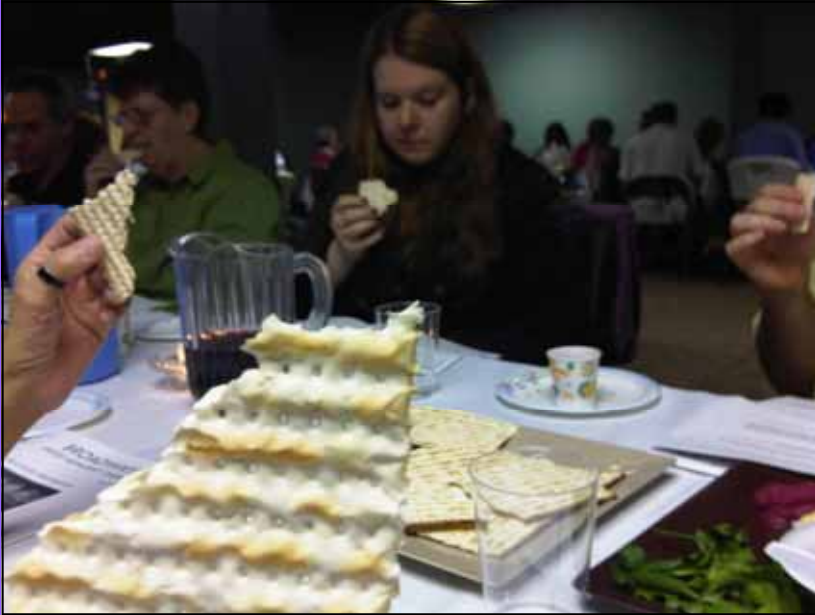
Above: Blessing over the matzah.

Thanks be to God for the many volunteers who made our “Great Three Days” from Maundy Thursday to Easter morning possible – thanks to those all who helped set-up and clean-up, to the Vigil-keepers, to the cooks, to the writers and readers, to the musicians, to the organizers...we are grateful for your ministries! Check out some pictures from this year’s Seder Meal