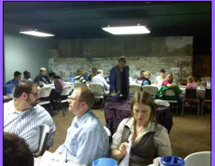
A meal of remembrance — of the “narrow place” and God’s faithfulness.