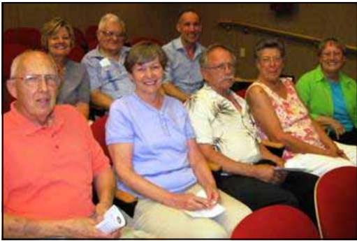
June 24, 2010 — Bloomers at the Pride Interfaith panel discussion at the Tolerance Education Center in nearby Rancho Mirage